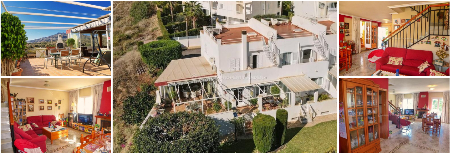
Casa Palmeral - A duplex in the Mojacar Playa area. (Resale)

A fabulous 5 bedroom, 2 bathroom end terrace triplex with a build of 170 m 2 , and with partial sea views situated just a few minutes from the beach in Urbanización Chamberi II. The property is in very good condition and downstairs has a large lounge-dining room with an open fireplace and double doors leading to the terrace with a retractable awning for shade. A door leads into the fully fitted kitchen, next to this another door leads to the fitted cloakroom with WC and wash hand basin.