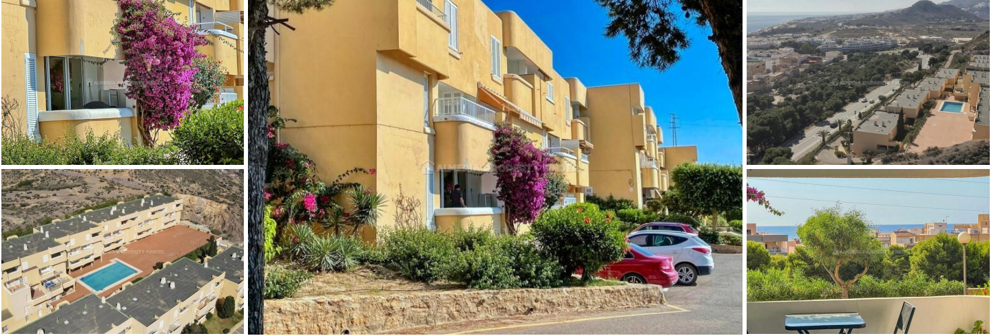
Apartamento Lila - An apartment in the Garrucha area. (Resale)

A lovely 2 bedroom ground floor apartment with a floor space of 70m 2 with sea views situated just a few minutes from the beach in Urbanisation Los Farmaceuticos.