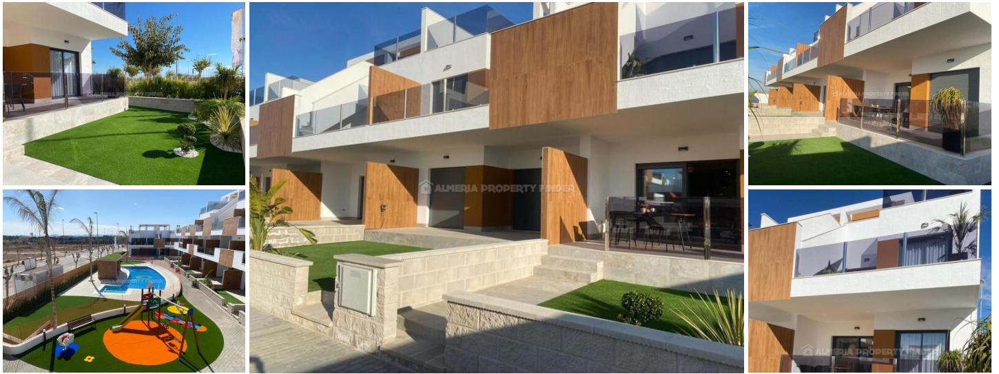
Lamar Resort Vii A3-b1 - An apartment in the Pilar de la Horadada area. (Newly Built)

LAMAR Resort Luxury VII is a luxury project of 34 apartments with 2/3 bedrooms and 2 bathrooms divided into 3 blocks with communal swimming pool, jacuzzi, gym, playground and garage with storage room. The ground floor apartments have large gardens, the first floor has terraces and the penthouses have a solarium with jacuzzi. The facades of these buildings are clad with high-quality ceramic tiles combined with a white dirt-resistant monolayer.