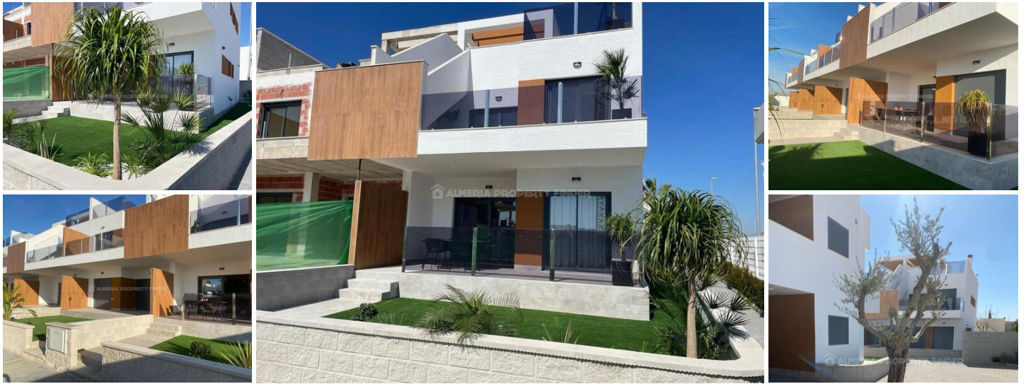
Lamar Resort Vii P8-b1 - An apartment in the Pilar de la Horadada area. (Newly Built)

LAMAR Resort Luxury VII is a luxury project of 34 apartments with 2/3 bedrooms and 2 bathrooms divided into 3 blocks with communal swimming pool, jacuzzi, gym, playground and garage with storage room. The ground floor apartments have large gardens, the first floor has terraces and the penthouses have a solarium with jacuzzi. The facades of these buildings are clad with high-quality ceramic tiles combined with a white dirt-resistant monolayer.