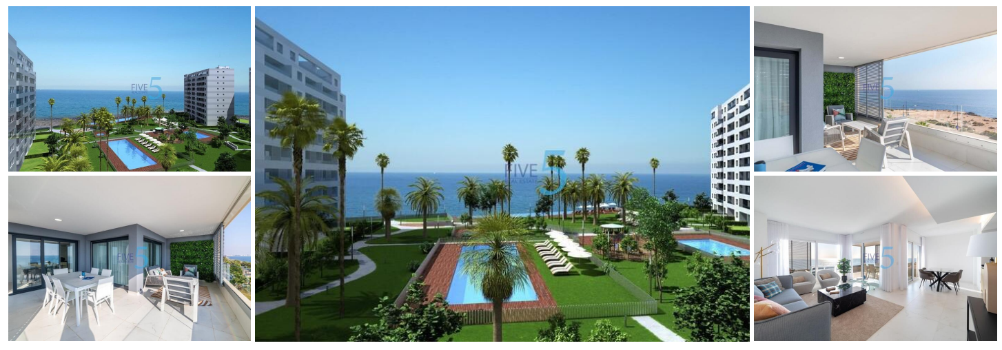
HOUSING IN FIRST LINE OF SEA

in Punta Prima, Torrevieja, with exclusive views of the sea and the beach.