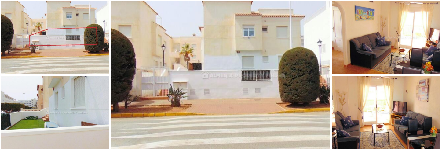
Apartment Lorraine - An apartment in the Mojacar Playa area. (Renovated)

*** EXCLUSIVE TO ALMERIA PROPERTY FINDER *** FULLY RENOVATED AND FURNISHED APARTMENT