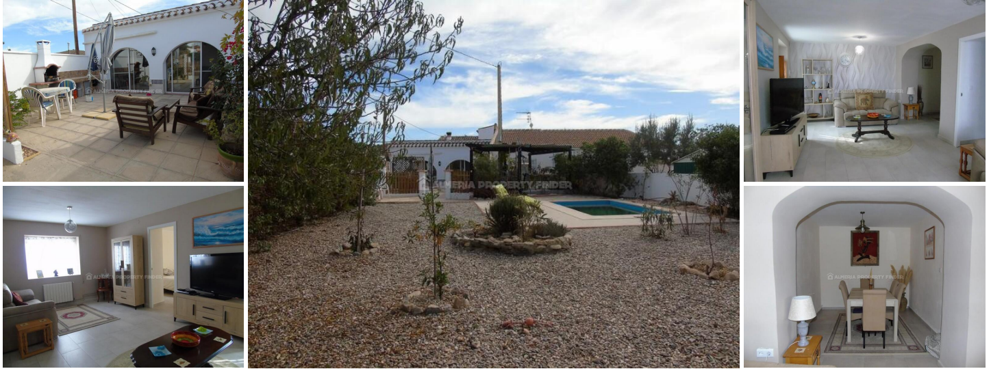
Cortijo Alma - A country house in the Albox area. (Resale)

A beautiful semi detached country property with four bedrooms, two bathrooms and a build of 197m 2 . The property is located in the pretty village of Las Pocicas which has amenities for daily living such as a shop, bars and a restaurant, the larger market town of Albox is approximately a 10 minute drive away which offers all amenities including a wide variety of shops, supermarkets, banks, post office, tapas bars, cafes, restaurants, 24 hour medical centre, sports facilities and two weekly markets.