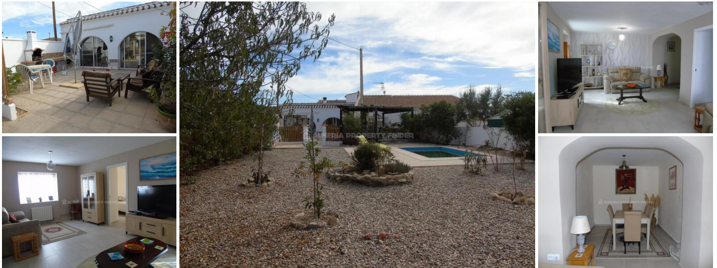
Cortijo Alma - A country house in the Albox area. (Resale)

A beautiful semi detached country property with four bedrooms, two bathrooms and a build of 197m 2 . The property is located in the pretty village of Las Pocicas which has amenities for daily living such as a shop, bars and a restaurant, the larger market town of Albox is approximately a 10 minute drive away which offers all amenities including a wide variety of shops, supermarkets, banks, post office, tapas bars, cafes, restaurants, 24 hour medical centre, sports facilities and two weekly markets.