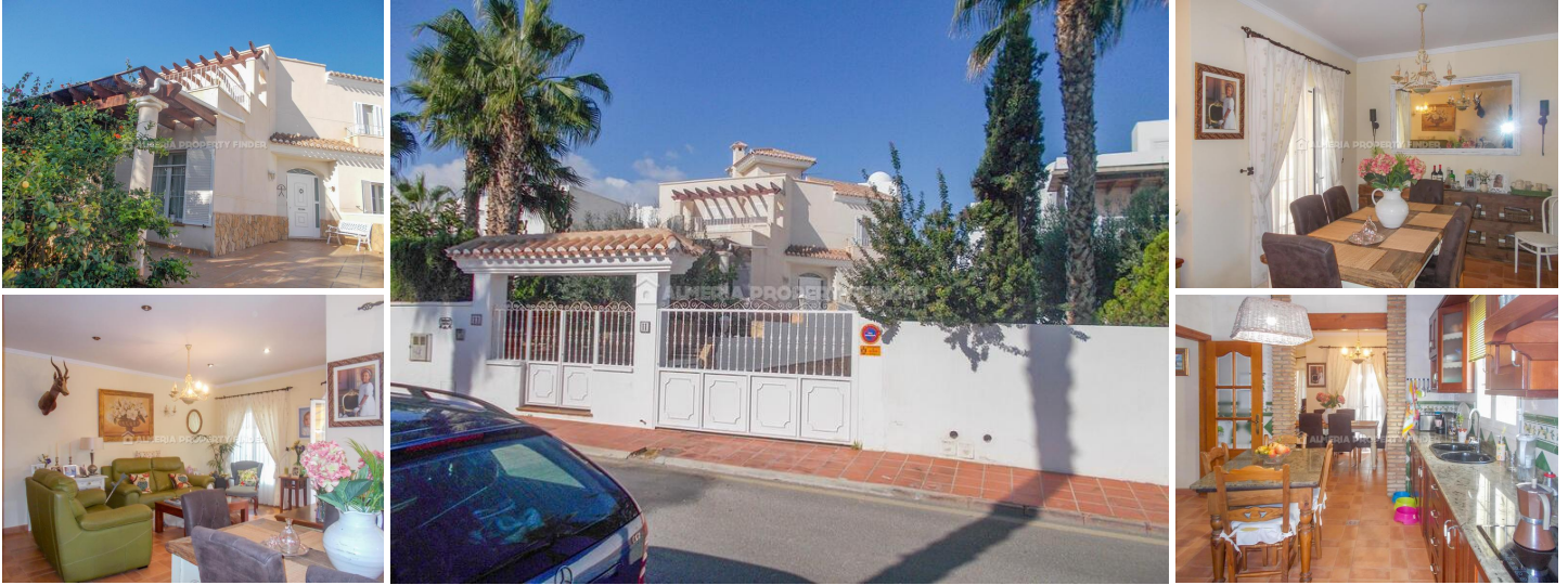
Villa Pinkie - A villa in the Mojácar Playa area. (Resale)

A beautiful family residence with a build of 196m 2 with numerous terraces, nice gardens and sea views in an unrivalled location in Mojácar. The property sits on a plot of 500m 2 and has fabulous sea views. There is an array of amenities in striking distance which makes this property an excellent choice if you prefer not to always have to get the car out.