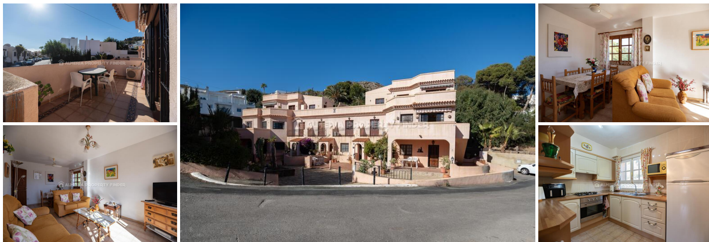
Apartment Cortez - An apartment in the Mojácar Playa area. (Resale)

Cueva del Lobo: First floor apartment with a lovely south facing terrace. Cueva del Lobo is a small complex of just 8 properties situated in a quiet location in a cul-de-sac that share a communal pool. The apartment has independent access and comprises living room / dining room with doors to the terrace and a window offering sea views, a relatively new kitchen with a good amount of storage space, the main bedroom with an en-suite shower room, a second double bedroom and a guest bathroom with full size bath. Both of the bedrooms have built in wardrobes. Parking is easy right next to the property and here you also have a storeroom.