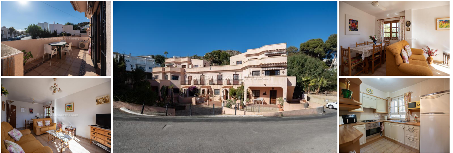
Apartment Cortez - An apartment in the Mojácar area. (Resale)

Cueva del Lobo: First floor apartment with a lovely south facing terrace. Cueva del Lobo is a small complex of just 8 properties situated in a quiet location in a cul-de-sac that share a communal pool. The apartment has independent access and comprises living room / dining room with doors to the terrace and a window offering sea views, a relatively new kitchen with a good amount of storage space, the main bedroom with an en-suite shower room, a second double bedroom and a guest bathroom with full size bath. Both of the bedrooms have built in wardrobes. Parking is easy right next to the property and here you also have a storeroom.