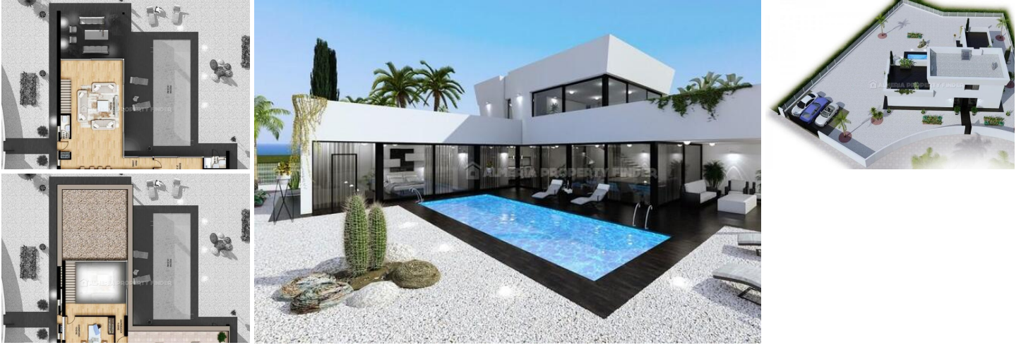
Villa Cabuzana 6 - A villa in the Vera area. (Off Plan)

Fabulous off plan villas in the area of La Cabuzana de Vera.