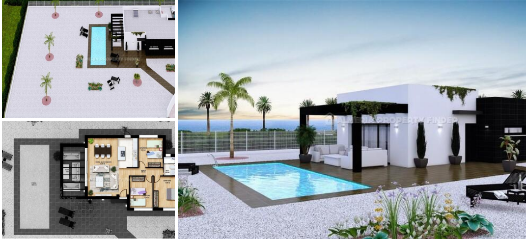
Villa Cabuzana 2 - A villa in the Vera area. (Off Plan)

Fabulous off plan villas in the area of La Cabuzana de Vera.