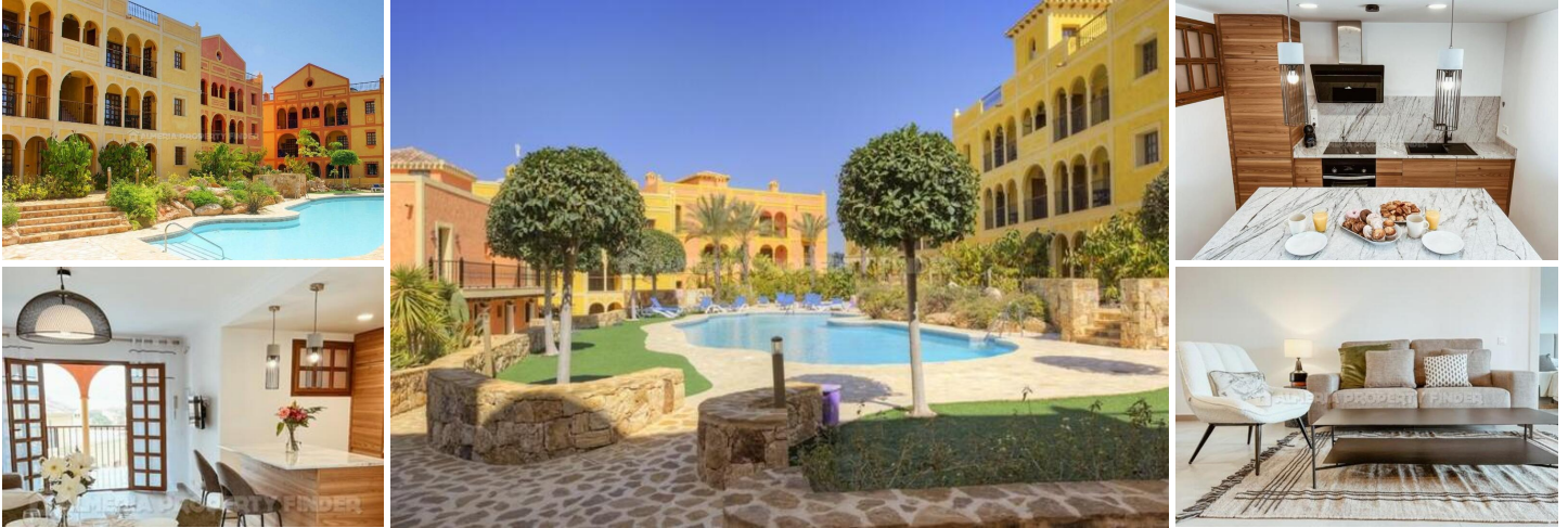
Desert Springs Sierra 146 - An apartment in the Cuevas del Almanzora area. (Newly Built)

Las Sierras III is a private residential development with a selection of NEW two and three-bedroom 'Key-Ready' Apartments set around a private swimming pool, complete with outdoor lounge space, within beautiful landscaped gardens, occupying an envious position on Desert Springs Resort.