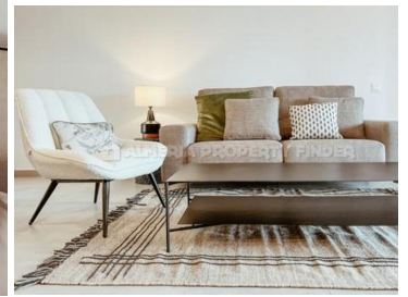
Desert Springs Sierra 347 - An apartment in the Cuevas del Almanzora area. (Newly Built)

Las Sierras III is a private residential development with a selection of NEW two and three-bedroom 'Key-Ready' Apartments set around a private swimming pool, complete with outdoor lounge space, within beautiful landscaped gardens, occupying an envious position on Desert Springs Resort.