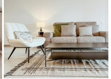
Desert Springs Sierra 347 - An apartment in the Cuevas del Almanzora area. (Newly Built)

Las Sierras III is a private residential development with a selection of NEW two and three-bedroom 'Key-Ready' Apartments set around a private swimming pool, complete with outdoor lounge space, within beautiful landscaped gardens, occupying an envious position on Desert Springs Resort.