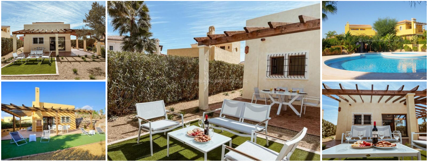
Desert Spring Gold I 13 - A town house in the Cuevas del Almanzora area. (Newly Built)

HOMES WITH MODERN APPEAL REFLECTING THE HERITAGE OF TRADITION WHILST OFFERING A STYLISH CONTEMPORARY FEEL