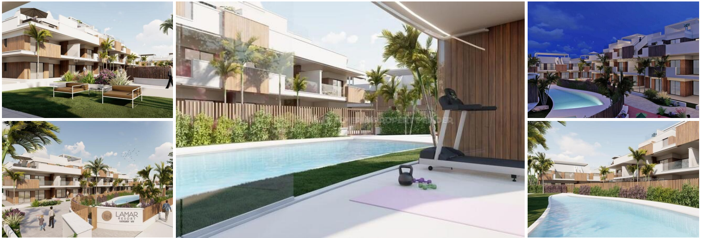
Lamar Resort Vii A29-b3 - An apartment in the Pilar de la Horadada area. (Newly Built)

LAMAR Resort Luxury VII is a luxury project of 34 apartments with 2/3 bedrooms and 2 bathrooms divided into 3 blocks with communal swimming pool, jacuzzi, gym, playground and garage with storage room. The ground floor apartments have large gardens, the first floor has terraces and the penthouses have a solarium with jacuzzi. The facades of these buildings are clad with high-quality ceramic tiles combined with a white dirt-resistant monolayer.