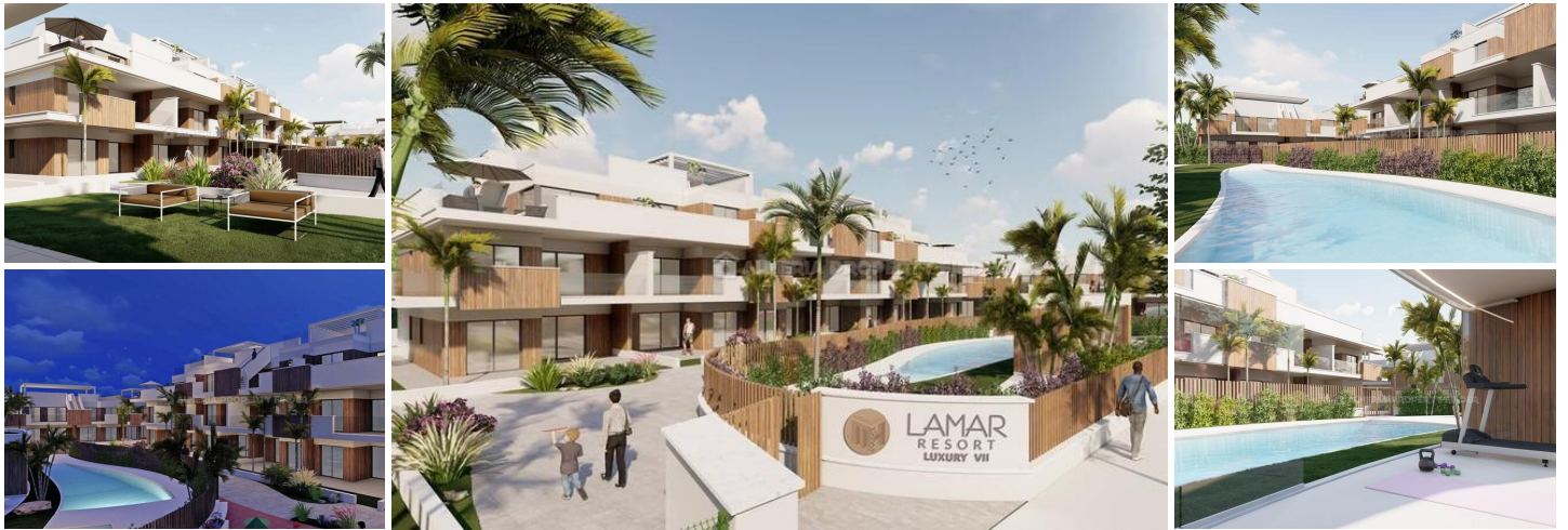
Lamar Resort Vii P26-b3 - An apartment in the Pilar de la Horadada area. (Newly Built)

LAMAR Resort Luxury VII is a luxury project of 34 apartments with 2/3 bedrooms and 2 bathrooms divided into 3 blocks with communal swimming pool, jacuzzi, gym, playground and garage with storage room. The ground floor apartments have large gardens, the first floor has terraces and the penthouses have a solarium with jacuzzi. The facades of these buildings are clad with high-quality ceramic tiles combined with a white dirt-resistant monolayer.