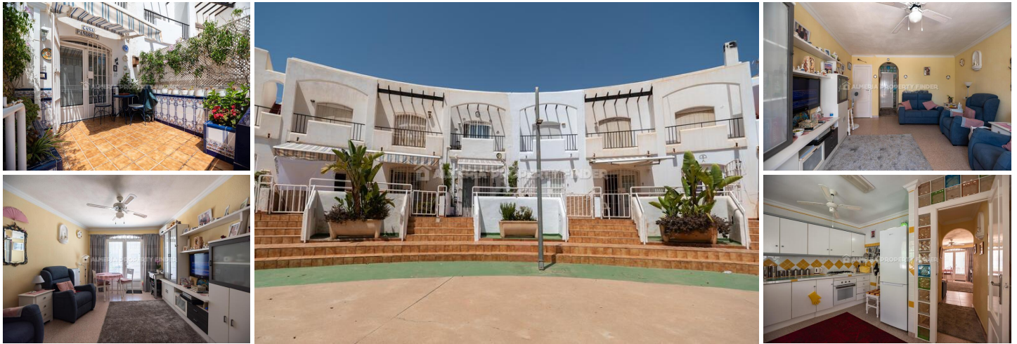
Town House Bianca II - A town house in the Mojácar area. (Resale)

Los Girasoles: A very nice two bed town house situated on a well located complex with a communal pool, sea views and views of Mojácar Pueblo. The property comprises a front terrace with awnings that is a perfect space for the morning sun, living room / dining room with air conditioning and doors to the front terrace, kitchen with new electric boiler and access to the rear garden and a shower room. A staircase to the first floor where you have two double bedrooms both with built in wardrobes and air conditioning and a bathroom with bath & shower over. One bedroom has access to the solarium and the other to a private terrace with sea views. The property benefits from an integral garage and fly screens throughout.