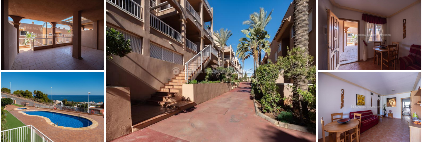
Apartment Chadwick I - An apartment in the Mojácar Playa area. (Resale)

Marina de la Torre : Ground floor 2 bed, 2 bath property for sale on a community with low community fees. There are two communal pools. You enter the property via a short flight of stairs onto a large covered terrace. The living room is a good size and has air conditioning. The kitchen has a service area off and is a good size complete with wall and base units.