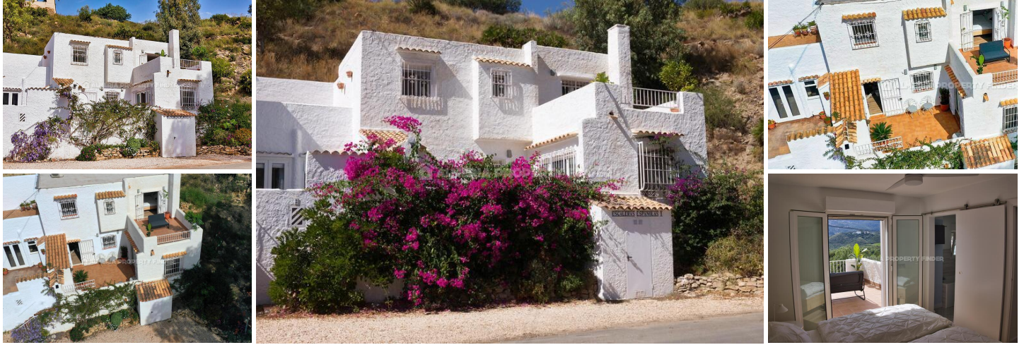
Town House Porter I - A town house in the Turre area. (Resale)

Escaleras Espanolas, Cortijo Grande : An altogether "state-of-the-art" house with 21st century systems. The property has recently been totally and completely refurbished to a very high standard with new wiring, plumbing, flooring and tiling throughout. It is a property with the 'WOW' factor and comprises 2/3 bedrooms and 3 bathrooms, fully fitted kitchen, living room / dining room and two terraces. All of the kitchen appliances are new with 5 year warranties including fridge, freezer, induction hob, extractor, fan assisted oven & dishwasher. All of the light fittings are with low energy LED bulbs. Both of the upstairs bathrooms have underfloor heating which is thermostatically and remote controlled. The living room and dining room have overhead DC motor fans and LED light with remote controls and all domestic plus sockets are complete with USB power points.