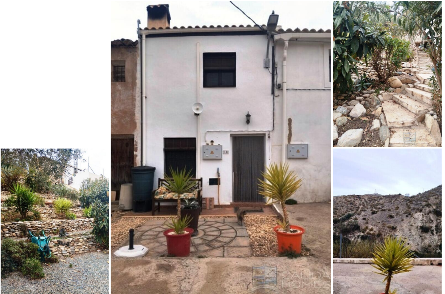
Cortijo Doris 2 and a ½ bedrooms, 1 and a ½ bathrooms

Set in the peaceful Los Molineros, Cantoria, 12 to 15 minutes drive from Arboleas town and a 2 minute drive to the popular Colorados bar/restaurant, fantastic tapa indoor and outdoor seating areas and pool table, a busy local bar with a great mix of Spanish and English.