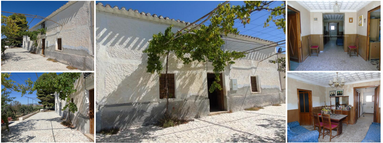
Casa Diego - A country house in the Albox area. (For Renovation)

A terraced habitable 2 bedroom country house for modernisation, on a plot of 481m 2 to include a large garage and garden. Additional land is available at separate negotiation.