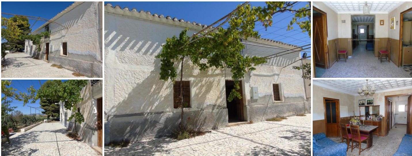
Casa Diego - A country house in the Albox area. (For Renovation)

A terraced habitable 2 bedroom country house for modernisation, on a plot of 481m 2 to include a large garage and garden. Additional land is available at separate negotiation.