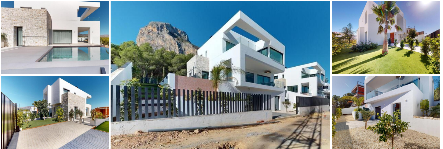
NEW BUILD VILLAS IN POLOP

New Build promotion of 6 Luxury Villas in Polop with views of the sea and mountains.