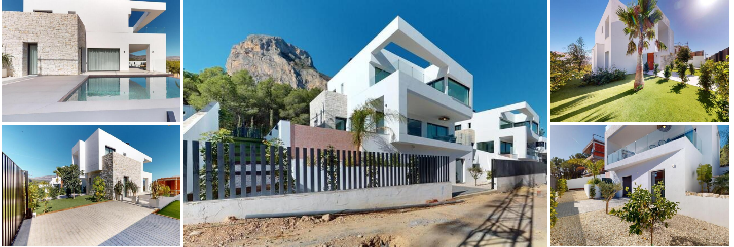
NEW BUILD VILLAS IN POLOP

New Build promotion of 6 Luxury Villas in Polop with views of the sea and mountains.