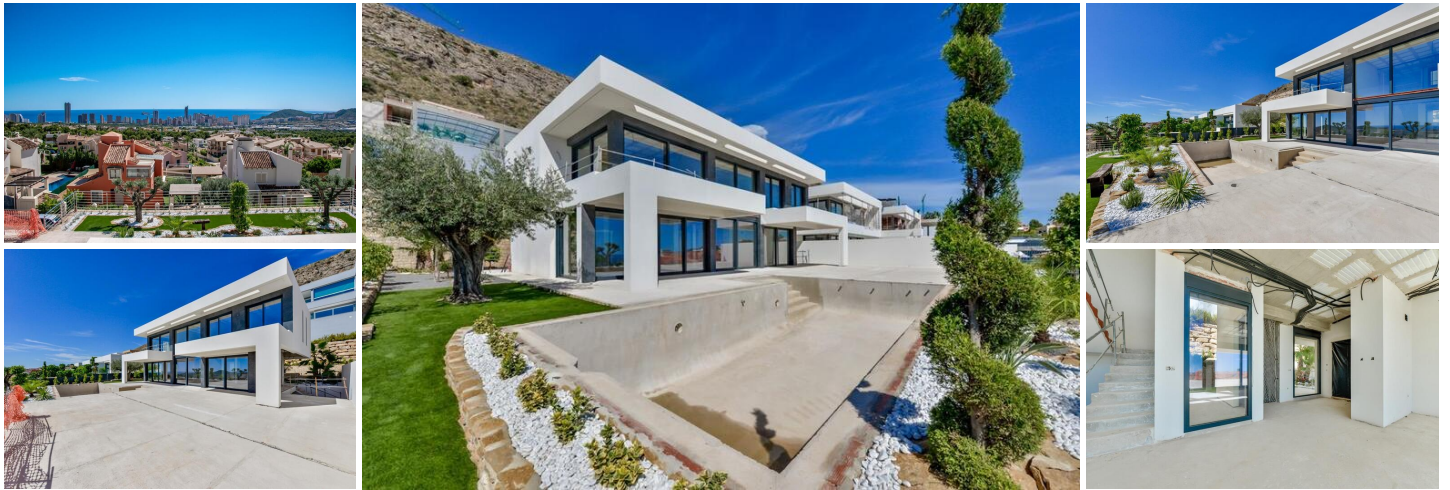
NEW BUILD LUXURY VILLA IN FINESTRAT WITH THE SEA VIEWS

New Build Luxury villa with the sea views in Sierra Cortina, Finestrat.