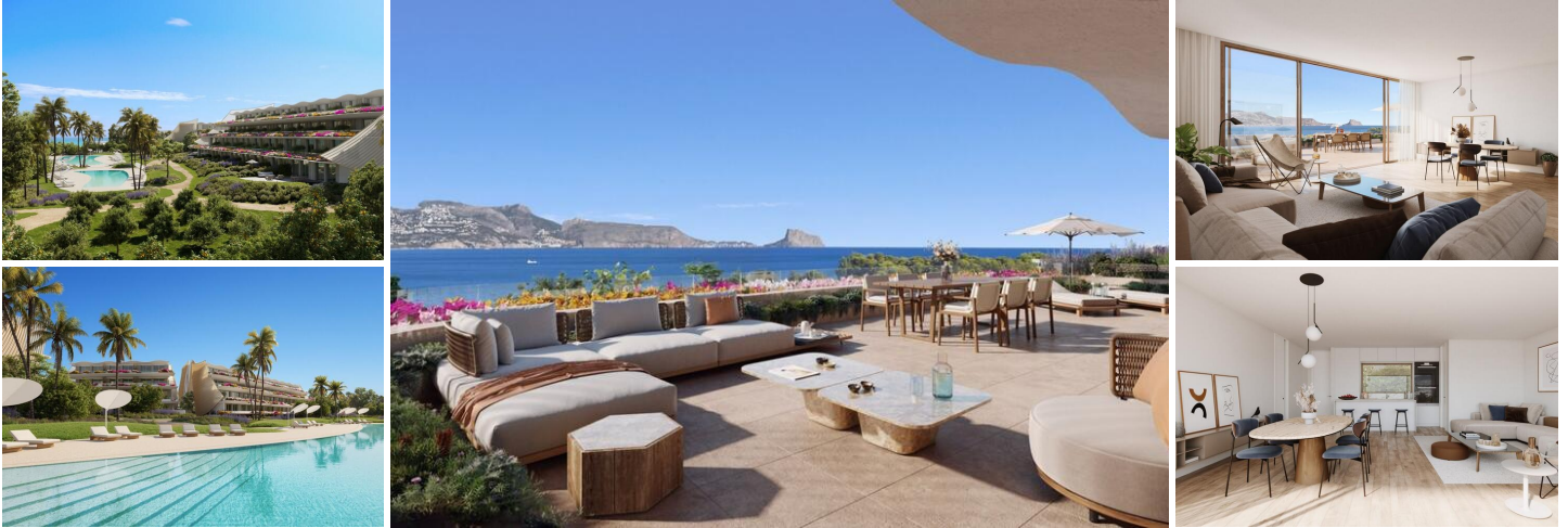
NEW BUID LUXURY COMPLEX OF APARTMENTS IN ALBIR

Luxury complex located in Costa Blanca close to the Playa del Albir.