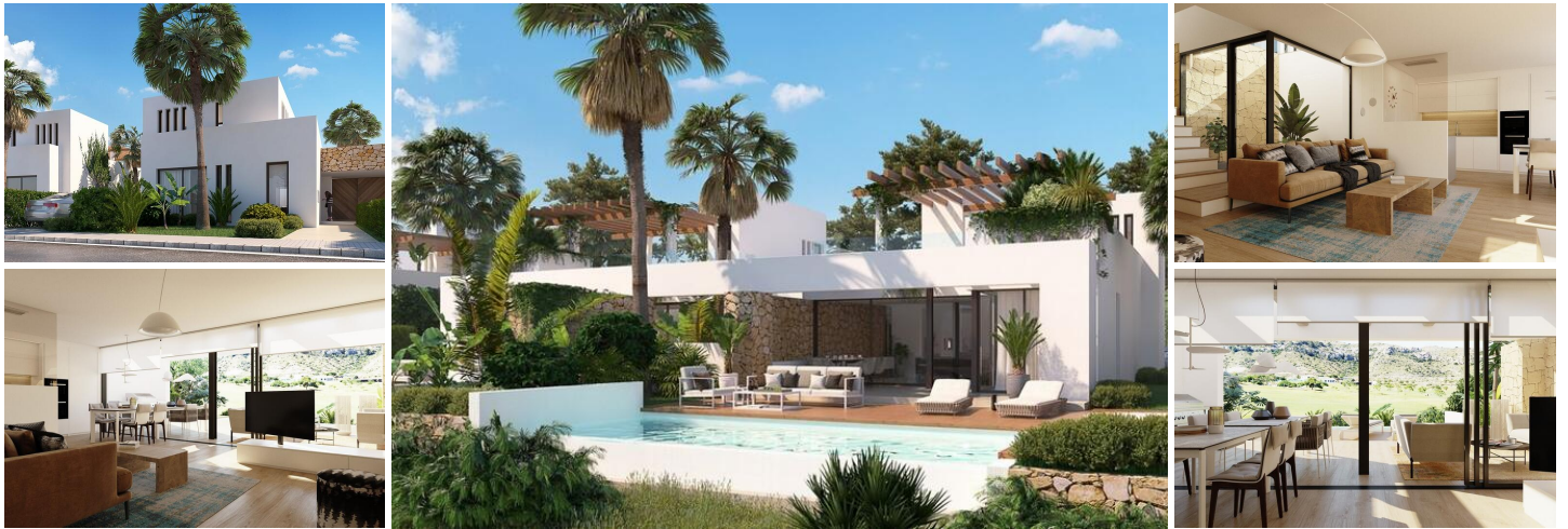
FRONT LINE GOLF NEW BUILD VILLAS IN FONT DEL LLOP, ALICANTE

New Built semi-detached villas has 3 bedrooms, 3 bathrooms, open plan kitchen with the lounge area, fitted wardrobes, basement, solarium, private garden with the swimming pool and parking space on the plot.