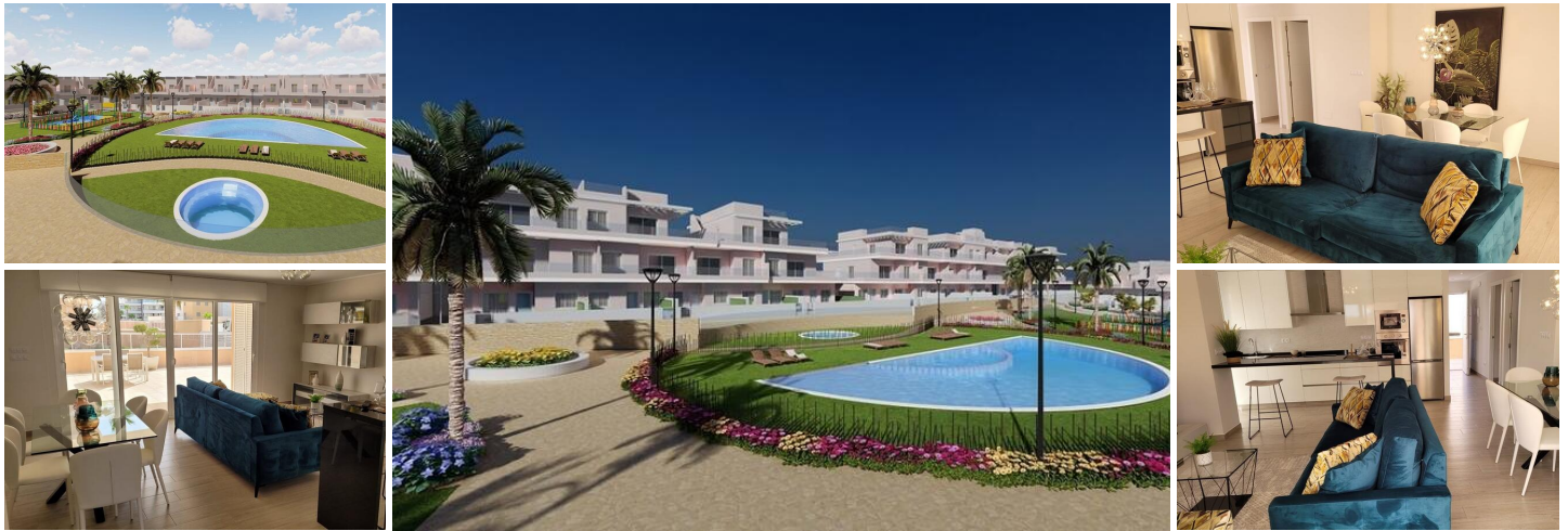
PENTHOUSE IN FANTASTIC RESIDENTIAL ON THE BEACH

Enjoy the Costa Blanca with all the comforts and facilities with the aroma of the Mediterranean Sea and its beaches, which is located just 400 meters from this wonderful residential area with gardens, playground for the little ones, community pool with Jacuzzi, and fitness area, in addition to, of course, equipped with private parking.