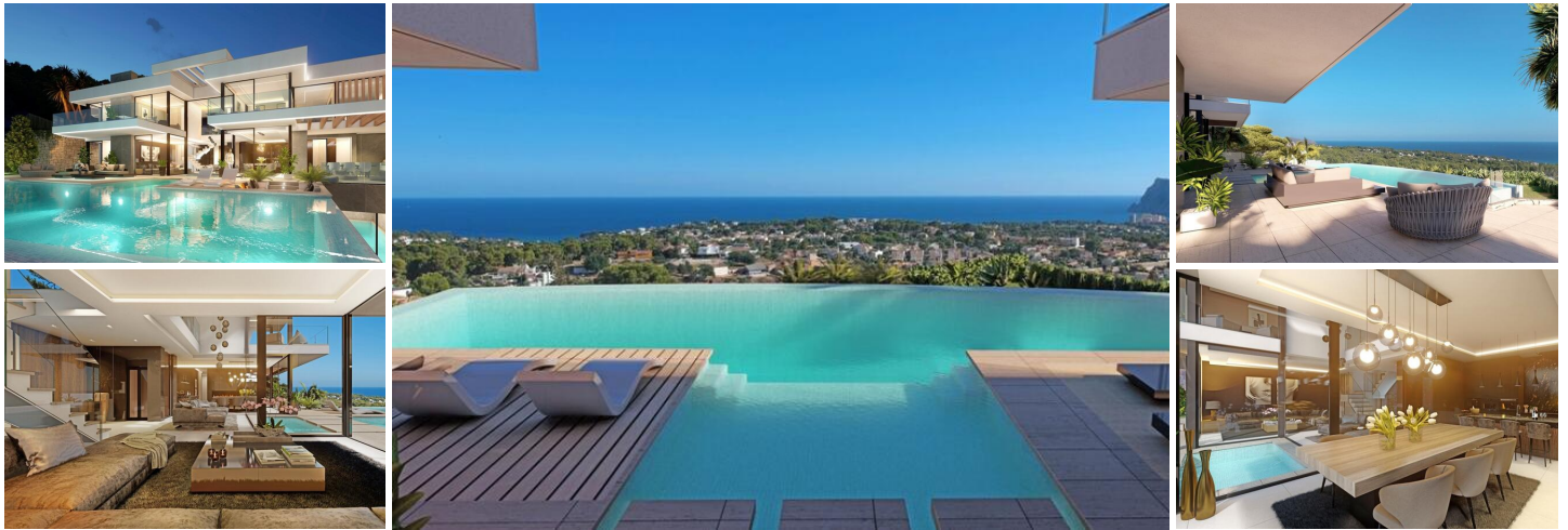
LUXURY NEW BUILD VILLA IN CALPE WITH SEA VIEW