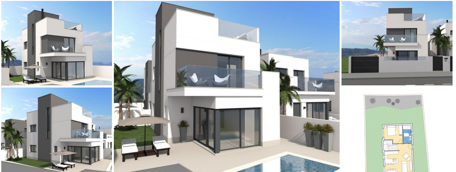
NEW BUILD VILLAS IN PINAR DE CAMPOVERDE

Beautiful New Build villa with private pool in Pinar de Campoverde.