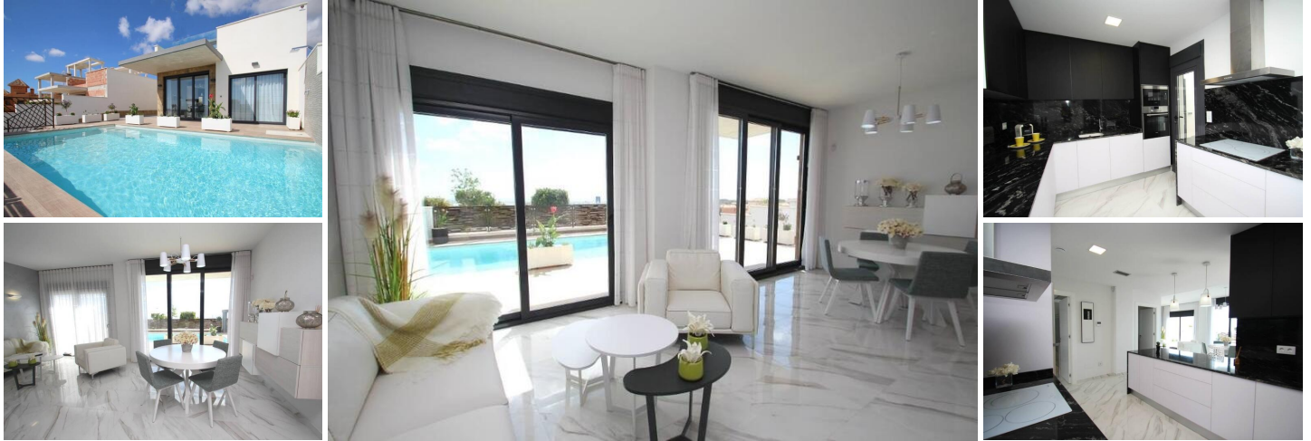
Newly built villa in Orihuela Costa

Do you want to enjoy an exclusive vacation near the sea? Impossible not to fall for this ultra-modern villa in Orihuela Costa with 2 bedrooms, 2 bathrooms, private pool, garden and luxury extras, according to personal preferences. Its delicate infrastructure integrates with nature providing a quiet and isolated environment.