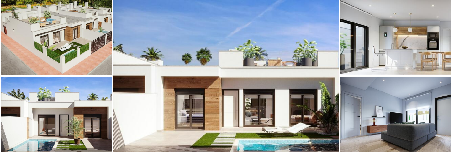
TERRACED VILLAS WITH PRIVATE POOL AND CLOSE TO RODA GOLF COURSE

Luxury complex of 28 one level terraced villas with a private pool for each house.