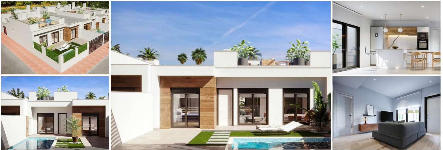
TERRACED VILLAS WITH PRIVATE POOL AND CLOSE TO RODA GOLF COURSE

Luxury complex of 28 one level terraced villas with a private pool for each house.