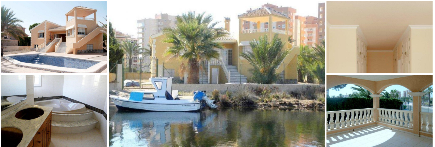
LUXURY VILLA WITH PRIVATE PIER

Between two seas, the Mar Menor and the Mediterranean, is this beautiful luxury villa on the La Manga peninsula (Murcia), with one of the most privileged views in the area, (and being a few meters from the beach) This property has a private jetty (for a boat up to 12 m) that allows access to the sea through a system of wide channels.