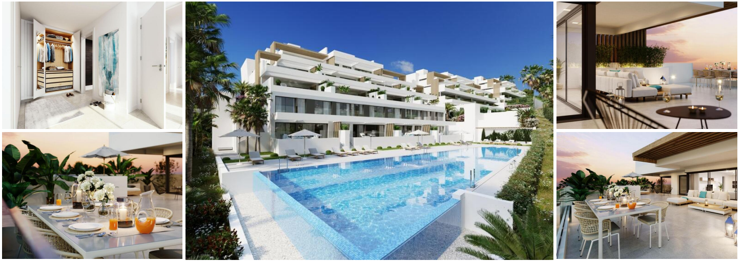
2 Bedroom penthouse with solarium in Las Mesas area of Estepona

LIF3 is a new under-construction development where modern living meets exceptional comfort! This exclusive residential enclave offers 40 thoughtfully designed homes featuring 2 and 3 bedrooms, each adorned with expansive terraces. Choose from ground floors with generous gardens or duplex penthouses boasting dreamy terraces for unique and special moments with your loved ones.