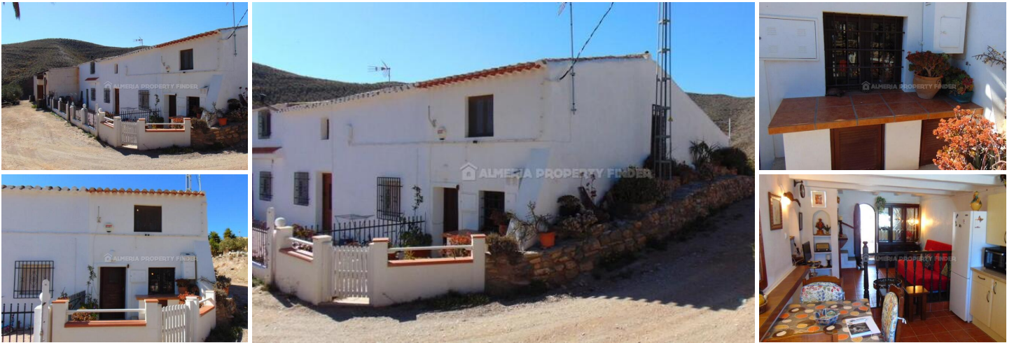
Cortijo Higuera - A country house in the Albox area. (Renovated)

Completely renovated cortijo with 70 m 2 built area, front garden, fly-free patio, fully equipped kitchen, living room, 2 spacious bedrooms, 1 spacious bathroom, fitted wardrobes, 500 m 2 of land, connected to electricity and water, heating with wood stove, built in 1930