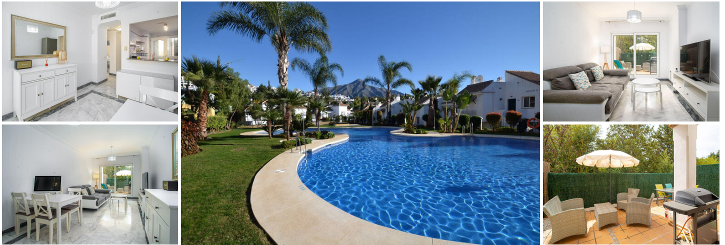
Apartment BRAHA - Nueva Andalucia

Privacy & Serenity, close to everything!