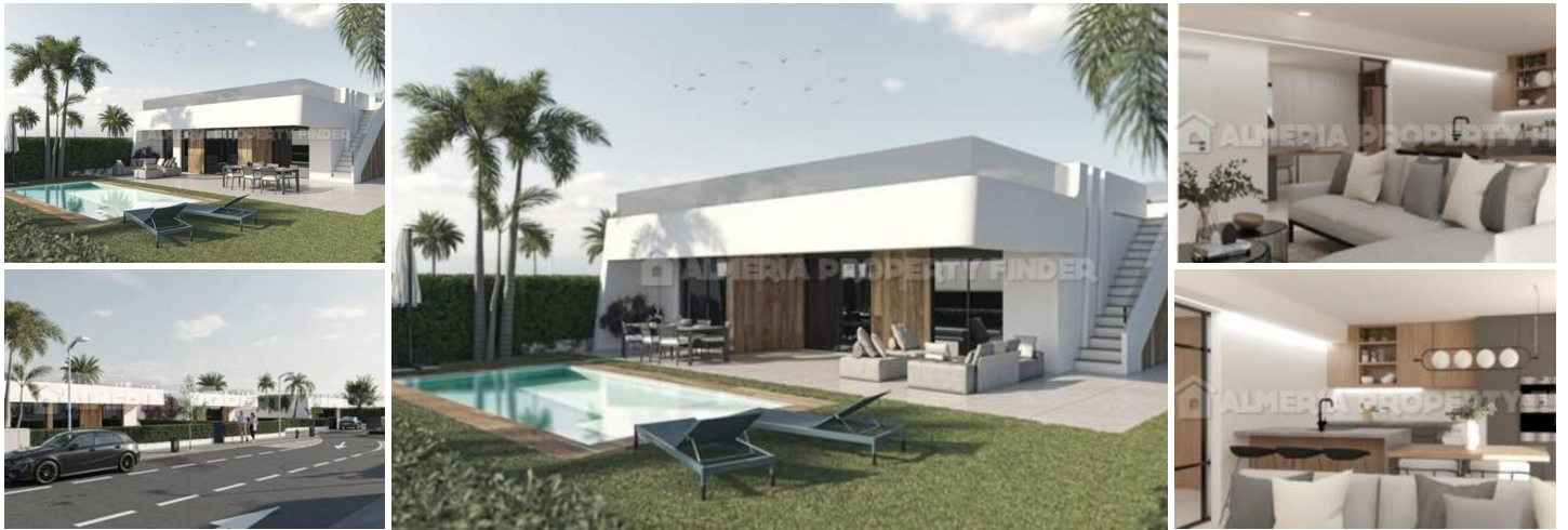
Atenea II villa 2 - A villa in the Alhama de Murcia area. (Newly Built)

Alhama Nature Resort - Atenea II - Villa No. 2