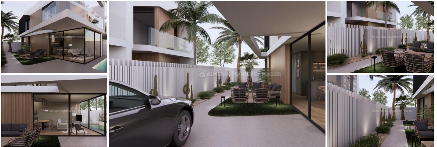
Ottawa Luxury Villa 2B - A villa in the Torre de la Horadada area. (Newly Built)

OTTAWA LUXURY VILLAS is a luxury project of 4 villas on independent plots with individual swimming pools and solariums on the upper floors. Located in La Torre de la Horadada (Alicante).