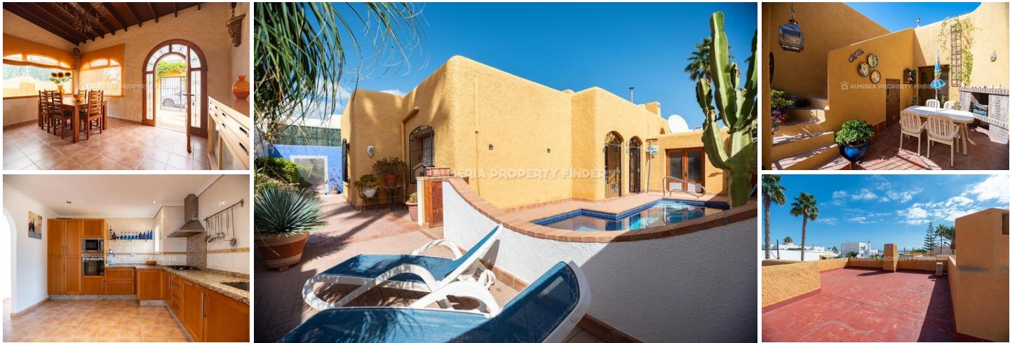
Villa Bunny I - A villa in the Mojacar Playa area. (Resale)

Canada Aguilar : We are pleased to offer for sale a beautifully maintained and nicely decorated property with 3 beds and 2 baths. This detached property is constructed over one level with a closed garage and private pool. From the roof terrace you have views of the sea, and the mountains.