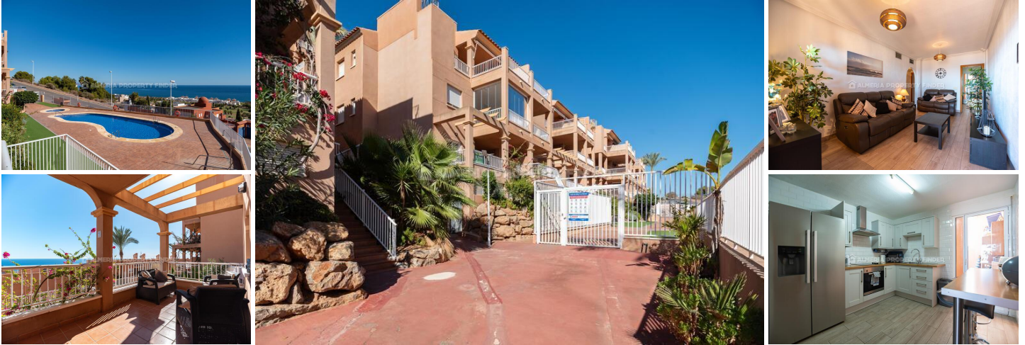
Apartment Collen - An apartment in the Mojacar Playa area. (Resale)

Superbly stylish and modern 3 bedroom, 2 bathroom east-facing apartment that has been completely renovated to a very high standard to include new flooring throughout, two new bathrooms and a new kitchen. The property comprises terrace with stunning sea views and views of one of the communal pools (there are two available for residents on this complex), living room, large kitchen with modern white tiles, with a full range of appliances including an American fridge, from the kitchen is an open terrace great for storage, the master bedroom has an en-suite bathroom with walk in shower, there are two further double bedrooms and a guest bathroom. In addition, there is reversible air conditioning throughout, security grilles on the main windows and a new boiler has been installed.