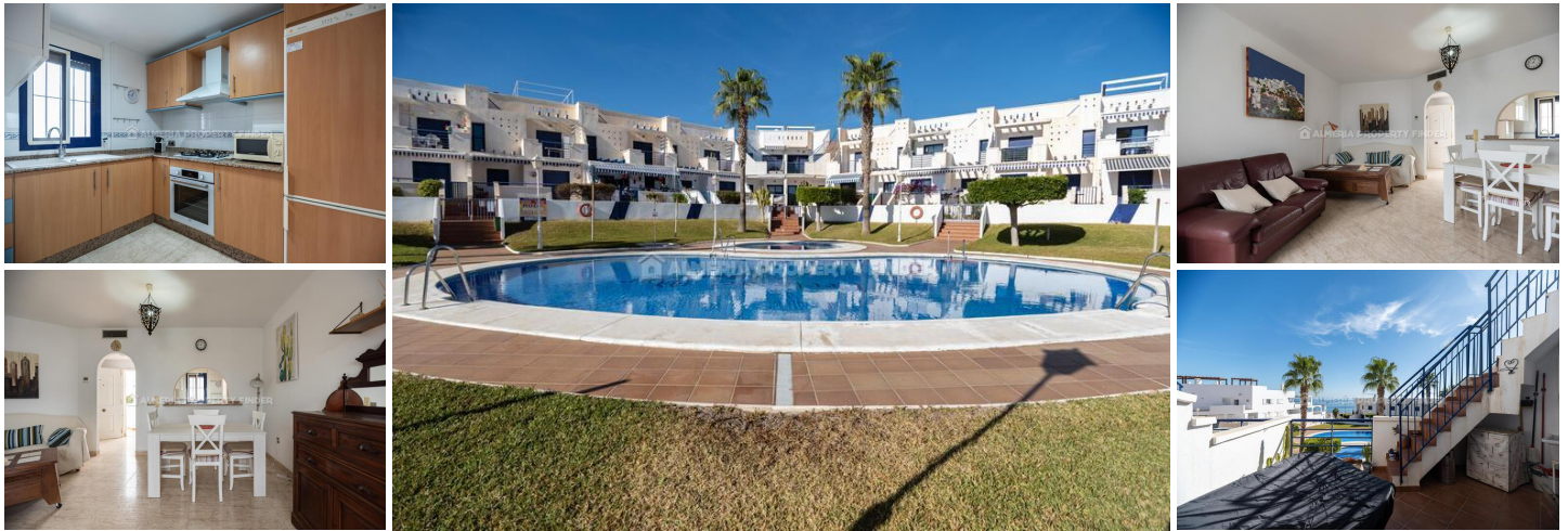
Apartment Palmira I - An apartment in the Mojácar Playa area. (Resale)

Situated a minutes walk from the beach, Perla Del Mar is a much sought after complex with a super communal pool and well tended gardens. We are pleased to offer for sale a very well presented 3 bed, 2 bath apartment with private terrace, roof solarium and views of the sea, the communal pool and the Mojácar village. This south facing property comprises entrance hallway with built in storage, a well fitted kitchen with a decent amount of work surfaces and units with an archway to a shaped living room with plenty of room for a dining table and with doors to the terrace, master bedroom with built in wardrobes and a sea view, en-suite shower room, two double bedrooms and a bathroom with bath and shower over. The terrace is of a good size and houses the washing machine and the boiler, from here there is a staircase to the roof solarium with 360° views. In addition, the property has reversible air conditioning throughout, an allocated parking space, and entry phone, and will be sold furnished.