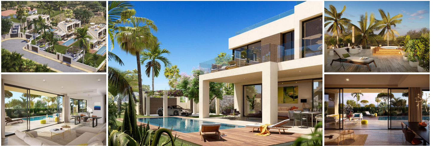
Villa EL BOSQUE

NEW CONSTRUCTION - DELIVERY IN 2ND QUARTER 2024