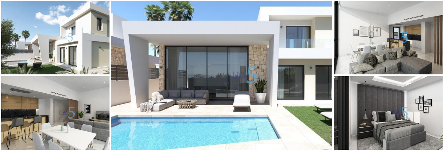
NEW BUILD VILLA IN TORREVIEJA

Beautiful New Build villa with private pool build over 1 floor with 3 bedrooms, 2 bathrooms, open plan kitchen with lounge area, terrace and private solarium.