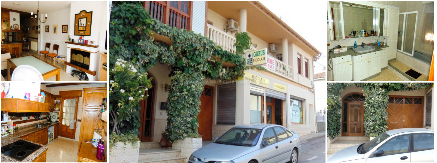
Casa Garus - A commercial in the Baza area. (Resale)

Commercial premises with house with 360 m 2 built, 216 m 2 plot area, 135 m 2 commercial area, 1 terrace, 1 covered terrace, 1 balcony, 1 garage, 2 living areas, fully equipped kitchen, 3 bedrooms, 2 bathrooms, 3 toilets, entrance hall, air conditioning, central music system, central heating, fuel oil, central hot water, shutters, floor ceramic, terrazo, marble