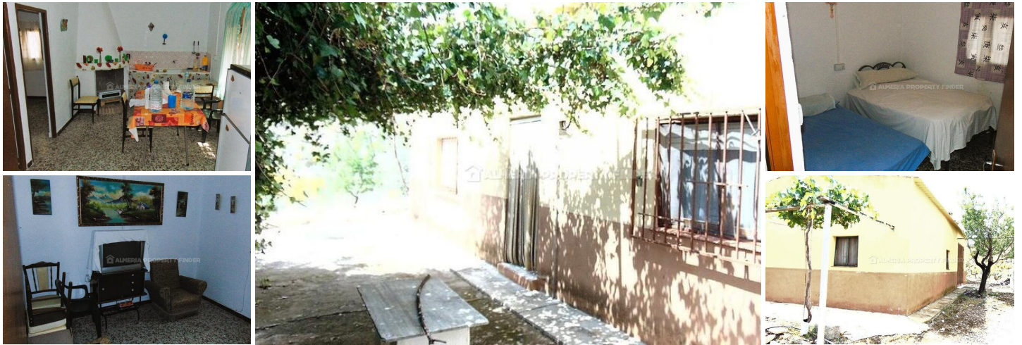
Finca Aljibe - A country house in the Lubrin area. (For Renovation)

In La Rambla Aljibe, a hamlet of Lubrín, you will find this large piece of land with a total area of 27,486 m 2 on which there are 2 buildings to renovate.