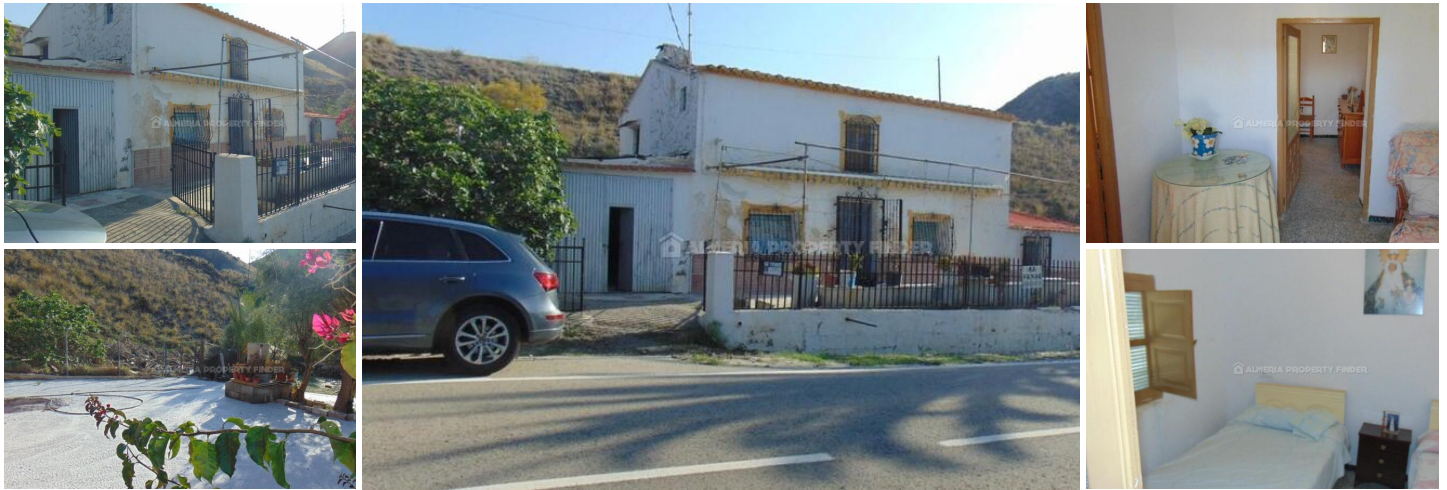
Cortijo Paco - A country house in the Arboleas area. (For Renovation)

Cortijo with 208 m 2 built, 176 m 2 usable area, 1209 m 2 land area, 5 bedrooms, 1 bathroom, 1 kitchen, 2 living rooms, 1 dining room, 1 garage, 1 storage room, 2 floors, air conditioning, mains water and electricity, to renovate, 100 years old.