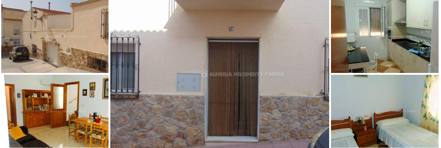
Casa San José - A village house in the Partalaoa area. (Renovated)

Village house with 264 m 2 built surface, 200 m 2 plot area, 5 bedrooms, 3 bathrooms, 3 toilets, 3 equipped kitchens, 4 living rooms, entrance hall, 2 stoves, wood fuel, fireplace, 1 garage, 1 terrace, 1 balcony, 1 storage room, air conditioning, shutters, fly screens, hot water central - electric.