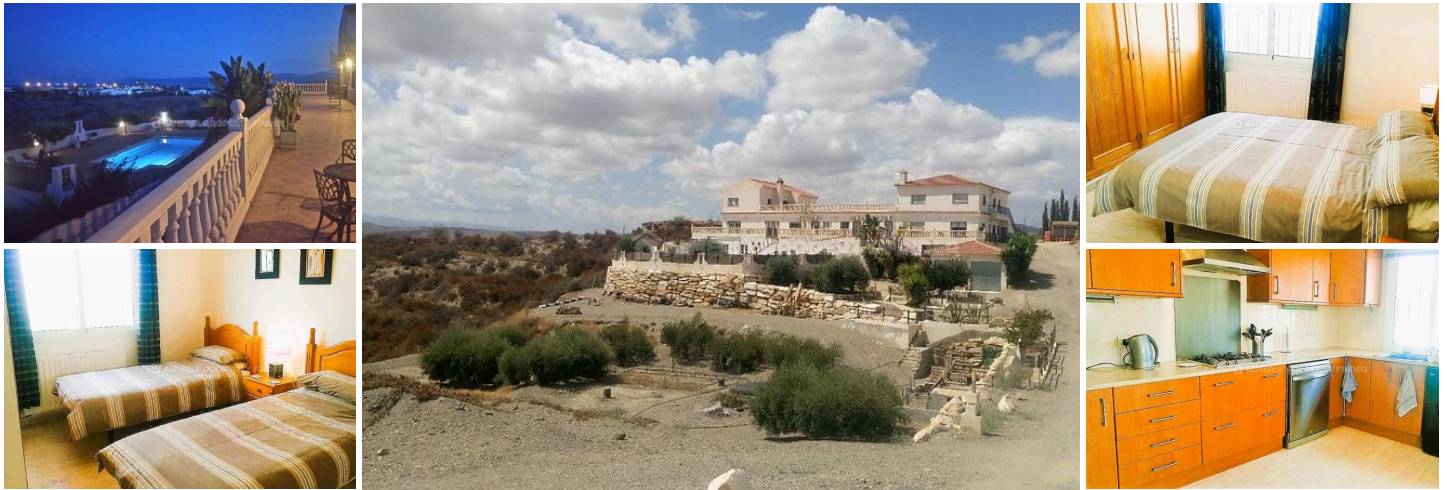
Casa Barranca - A villa in the Santa Maria de la Nieva area. (Resale)

Villa with 714 m 2 built, 595 m 2 usable area, 5718 m 2 plot area, 5004 m 2 garden area, 9 bedrooms, 8 bathrooms, 8 toilets, 2 garage/s, good condition, 8 closets, 2 terraces, 306 m 2 of terrace, kitchen with household appliances, storage room, orientation northwest, 2005, private pool, 2 floors, central heating, butane fuel, air conditioning hot and cold, central hot water, water heating butane, ceramic floor