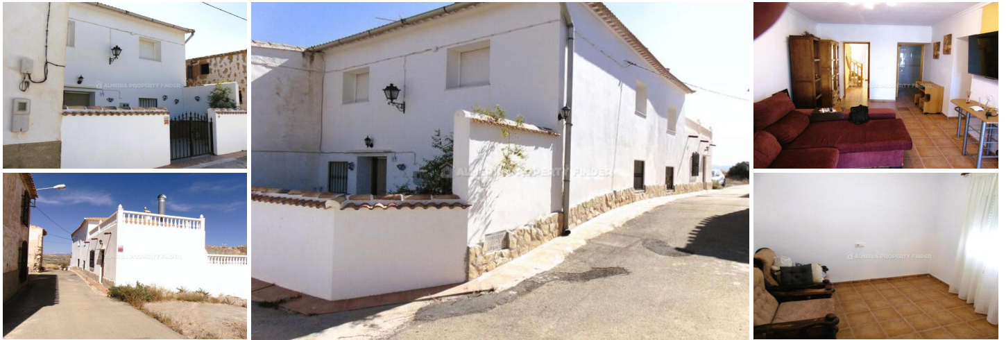
Casa Manu - A village house in the Zurgena area. (Resale)

Two-family house with 208 m 2 built, 171 m 2 plot area, 2 kitchens, 2 living areas, 2 bathrooms, 6 bedrooms, fireplace, 3 terraces, air conditioning, connected to mains electricity and water, well, completely renovated