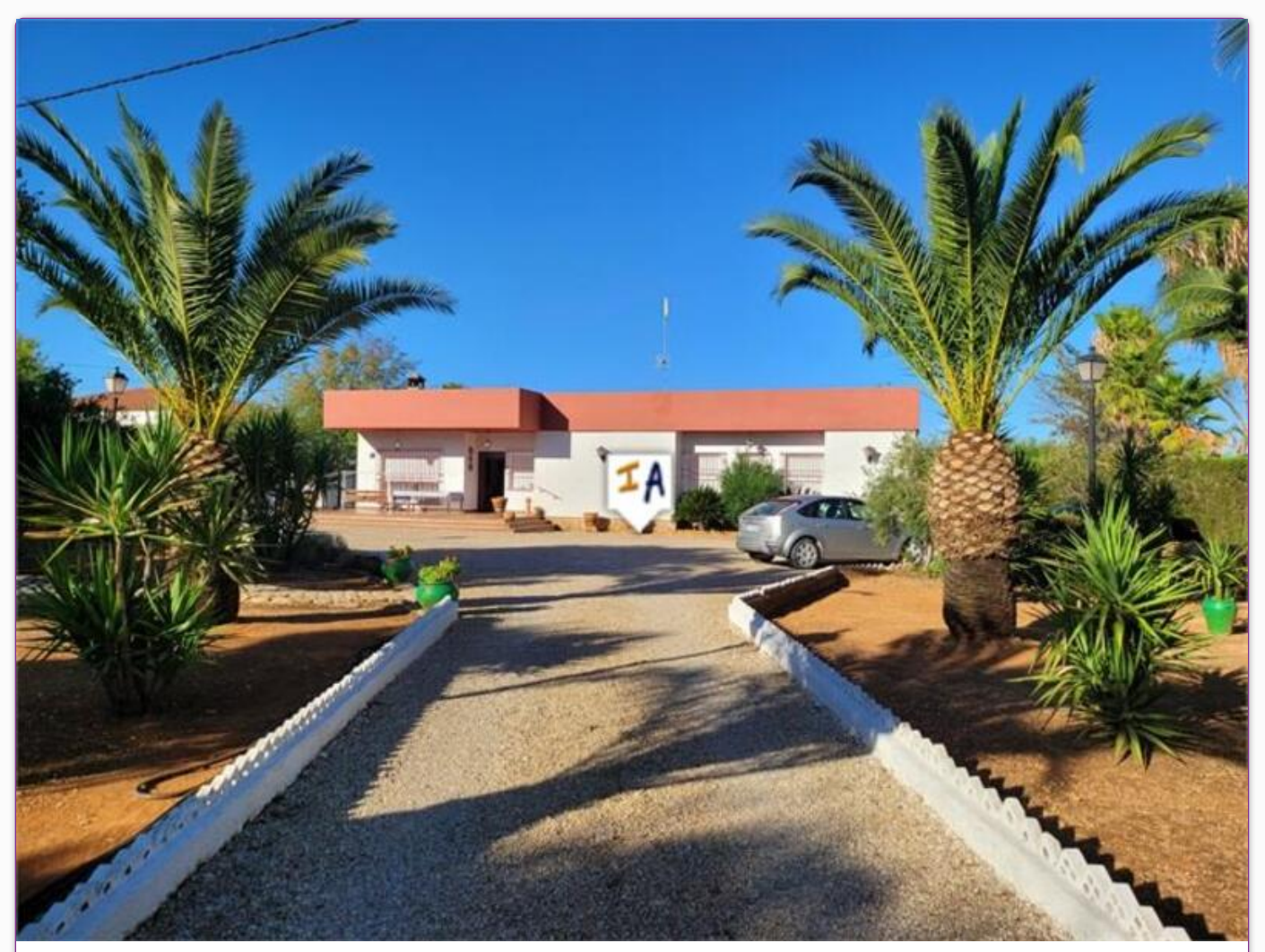
Villa in Puente Genil