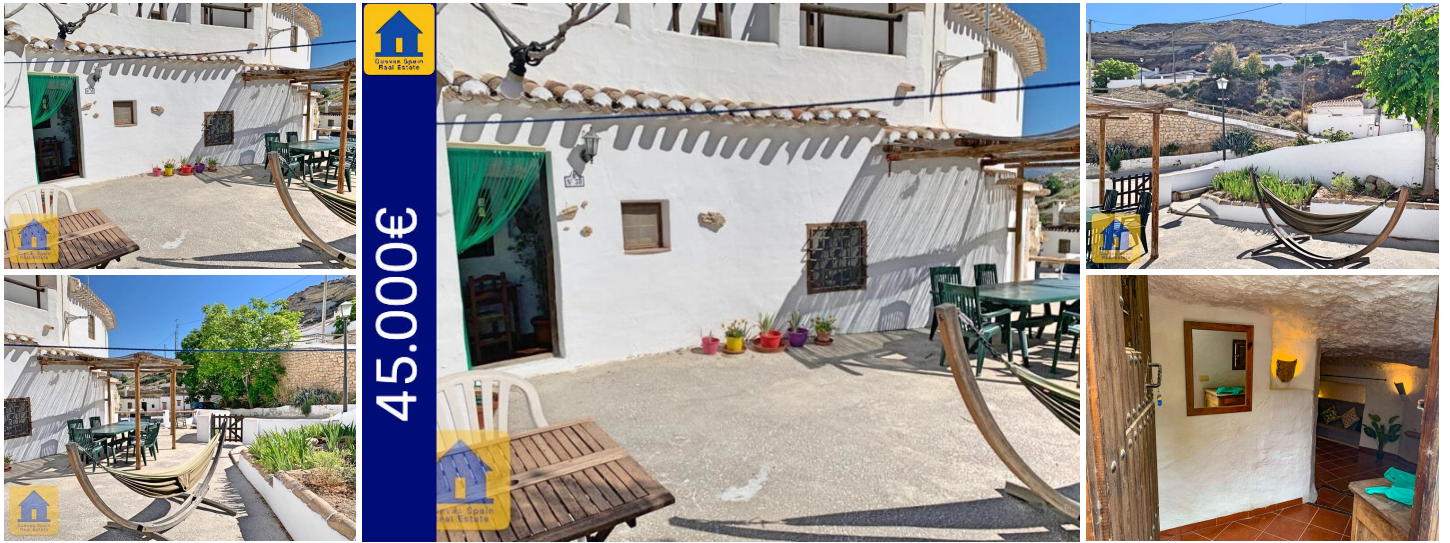
Galera Cave House Mallorie

This is a lovely, quirky, authentic cave house tastefully designed in a modern, minimalist style. There is a large patio with nice views and a private parking space. The entrance door has a tile eave and leads into an entrance hall. The living room and compact eat-in kitchen have a simple, zen feeling. Special attention has been given to the lighting. The wood burning stove in the kitchen has a practical baking oven. The kitchen design makes creative use of the space for storage and seating. There is a large, sunny main bedroom with a walk-in closet and a smaller double bedroom that could also be an office. The smaller bedroom is outbuild and has a wood beam ceiling. Each bedroom has a window, which is exceptional in a cave. The window of the main bedroom is built into an outer recess in the rock wall. There is a spacious shower room with a tile feature in the shower wall. The cave is sold with the furniture and is ready to move in.