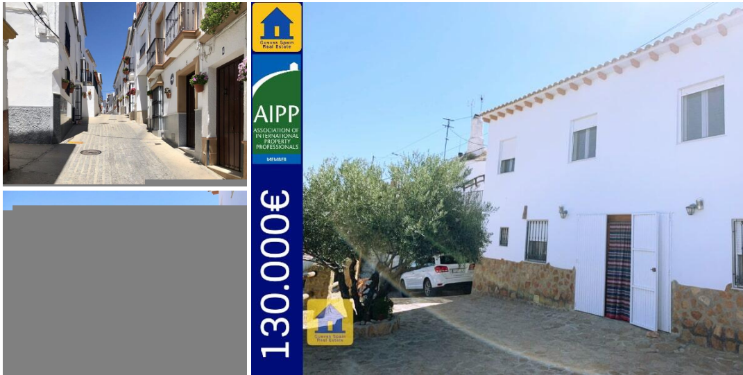
Castillejar Cave House Isabel

Large cave house up on a hillside of Castilléjar facing south-east with potential for three separate units. The property has a spacious, tiled front patio with a mature olive tree and magnificent views of the dramatic Badlands across the valley. From the patio, to the right one enters the cave and to the left one enters the two storey house. The three sections of the house are connected by an internal doorway. The main entrance to the house part leads to a very large, open plan living/dining/kitchen with bathroom and sleeping space as well. This could be a self contained studio. The top floor is an apartment with kitchen/dining room, bedrooms, and bathroom. It has an entrance that opens onto a patio leading to the road above. The cave has 3 bedrooms, a kitchen, and a bathroom. This property can be made into 2 units or 3 units. There is parking on the main level and on top of the house there is a large attic. There are lots of possibilities for this property including having a gym, large workshop or holiday rental. It is in a quiet location and ready to move in.